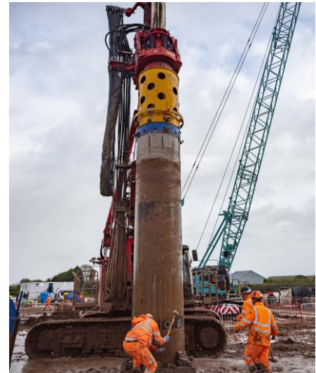
Progressing the piling works to prepare for the A38 retained cutting

As part of our work in the area, we have been considering options to maintain vehicle access on Park Lane in Whittington. To do this, we are planning to build a temporary diversion road next to Park Lane during construction. We will need to introduce some short-term road closures on Park Lane while we connect the new section of road to the existing highway, but this will significantly reduce disruption in the long term. We will update more about the Park Lane diversion this spring.