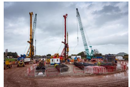
Our working area adjacent to the A38 southbound carriageway

We will share further HS2 updates in your area this summer.