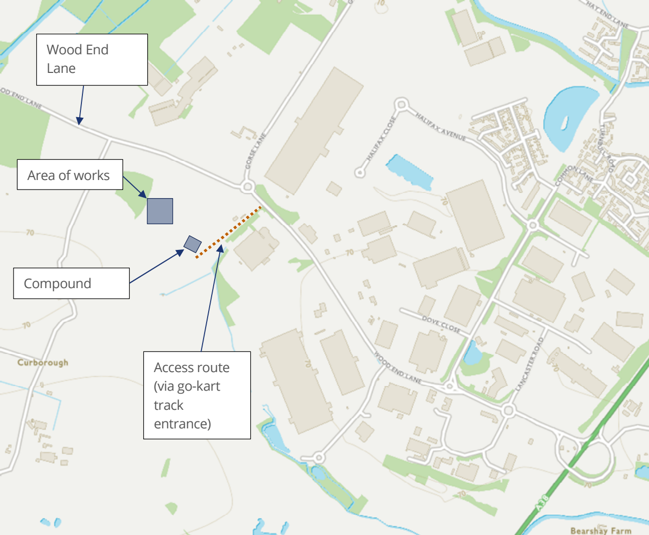
Contains ordnance survey ©Crown copyright and database right 2017